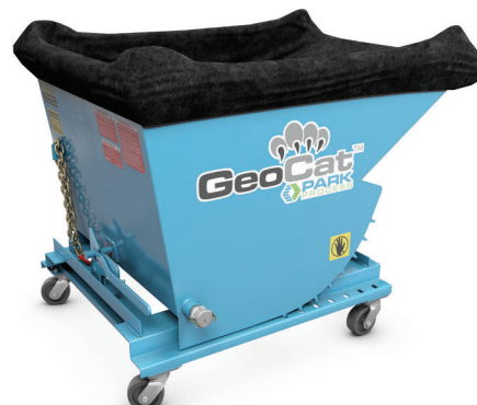
Self Dumping Hopper (DH)