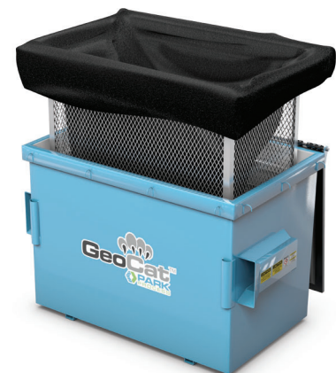
Front Loader (FL)